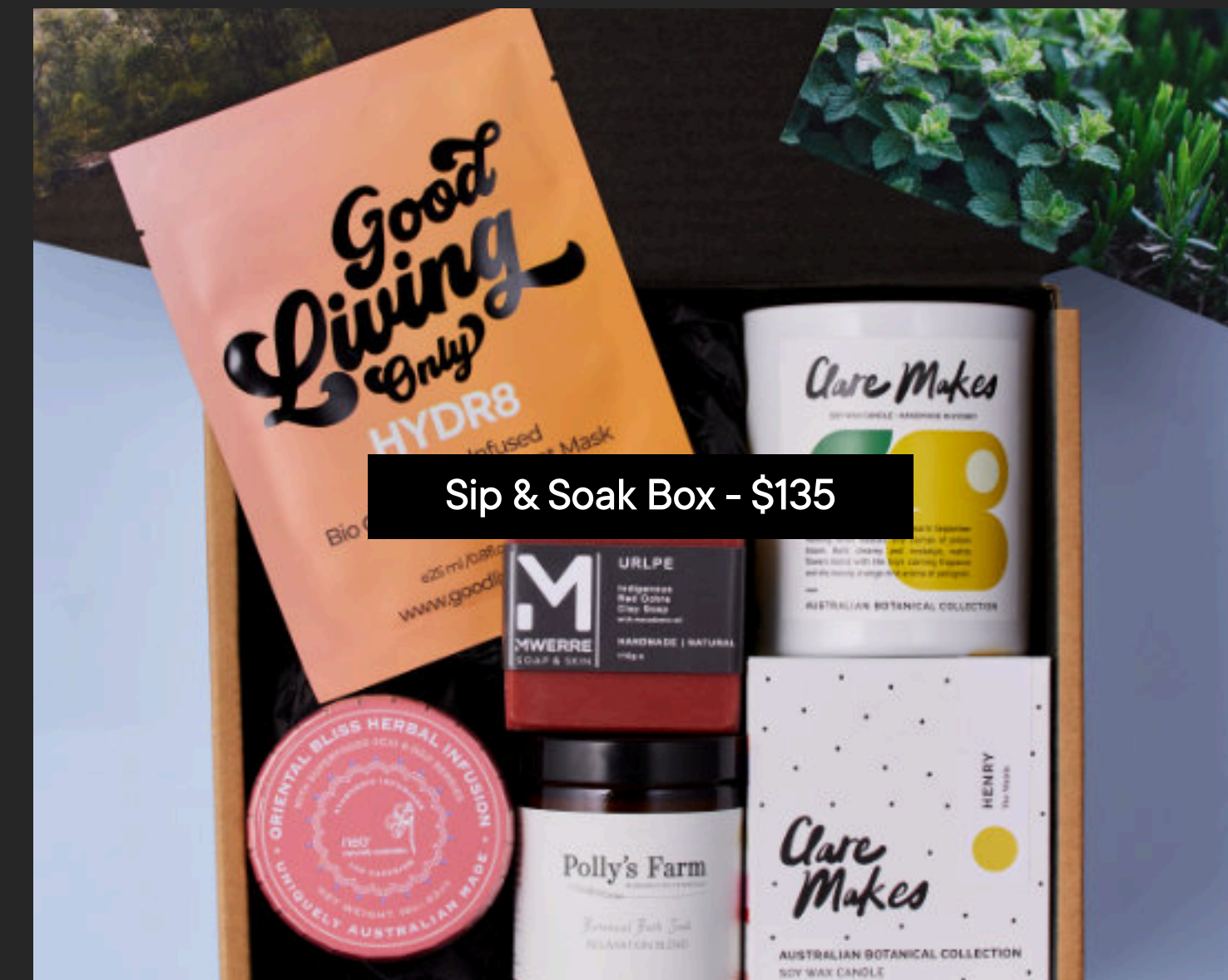
Sip & Soak Box - $135