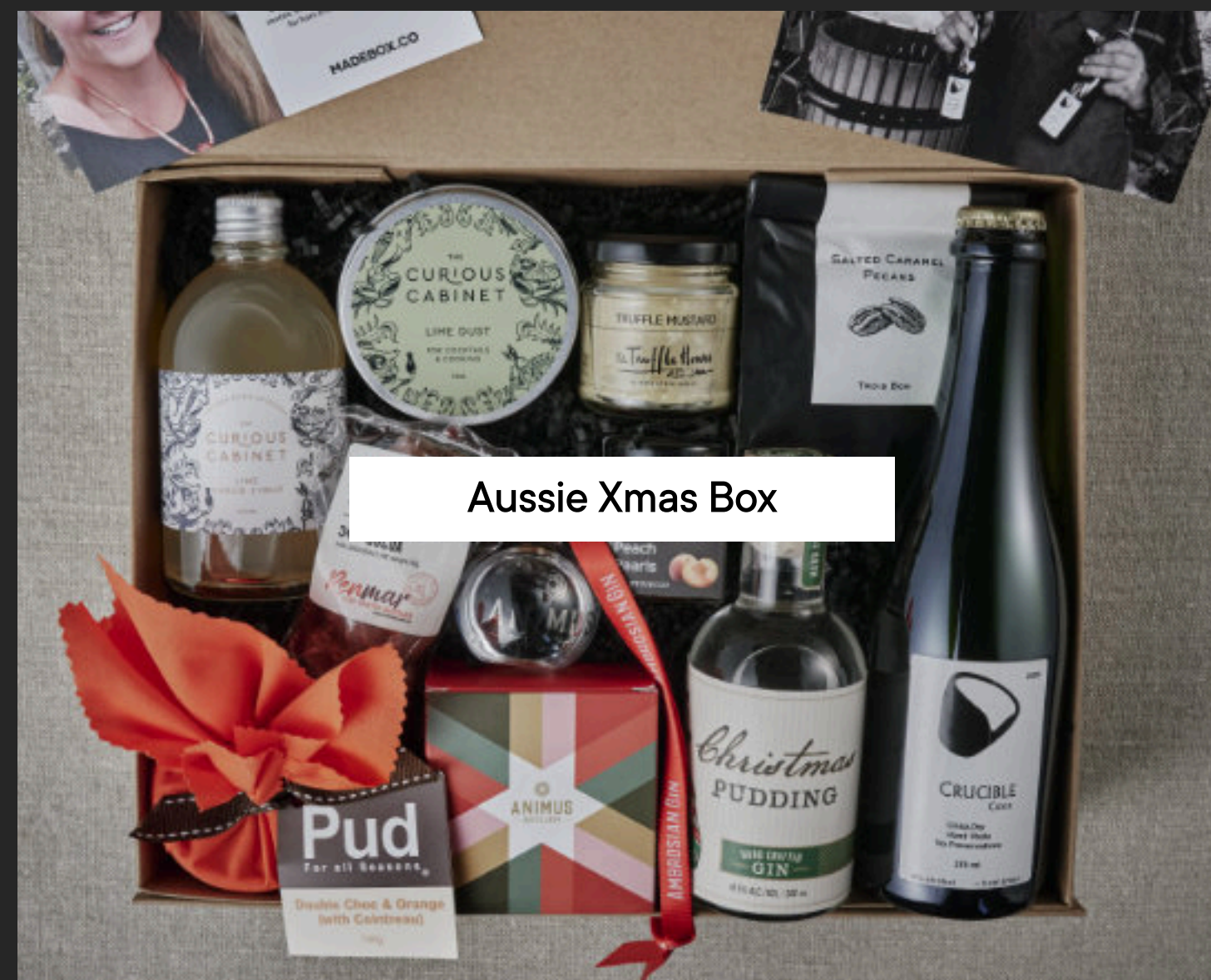
Aussie Xmas Box