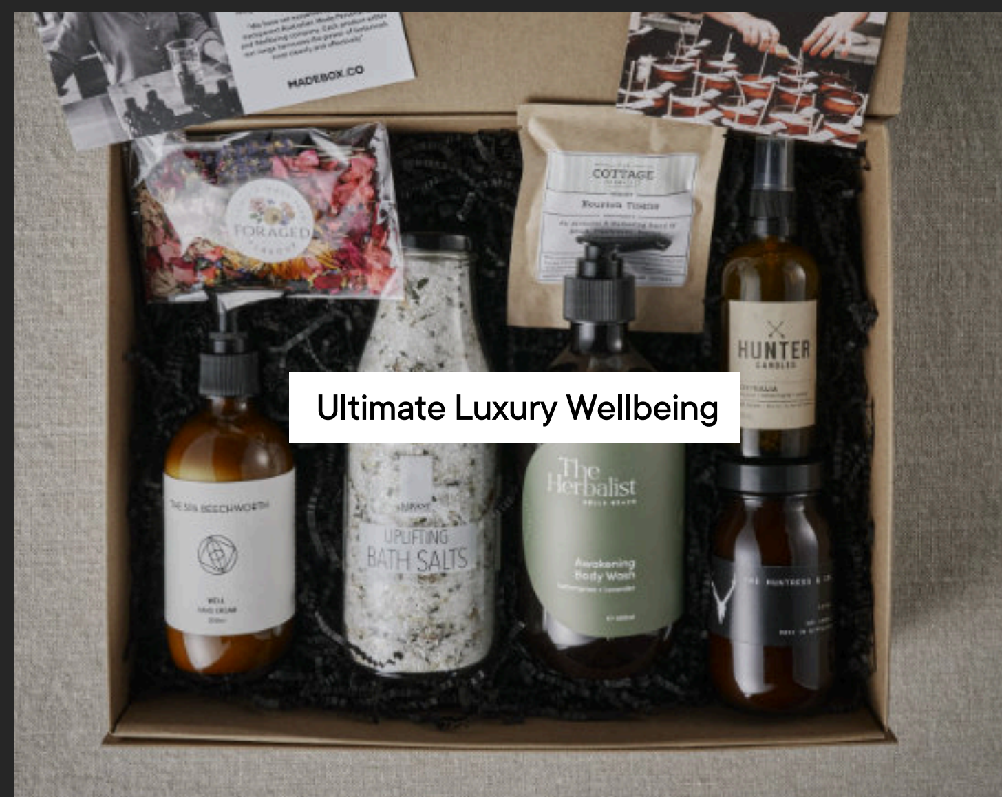
Ultimate Luxury Wellbeing

Ideas. Let us curate to suit your brief & budget.