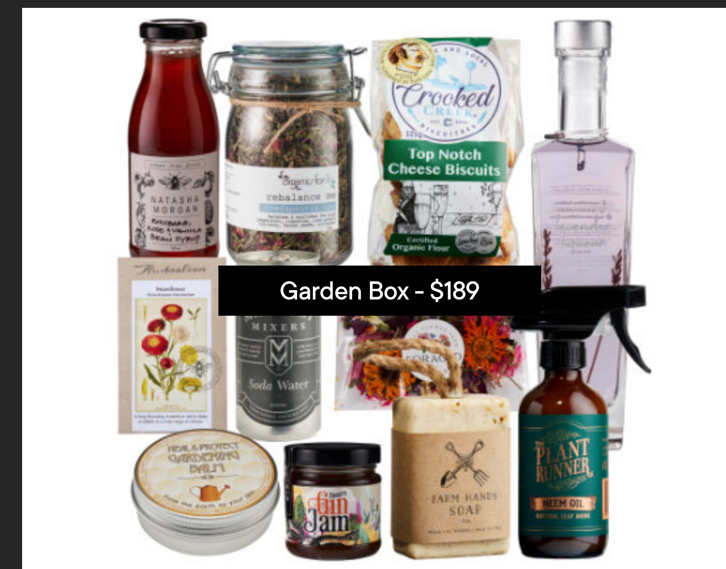
Garden Box - $189

Prices & products subject to change and availability. Contact us for accurate pricing & curation.