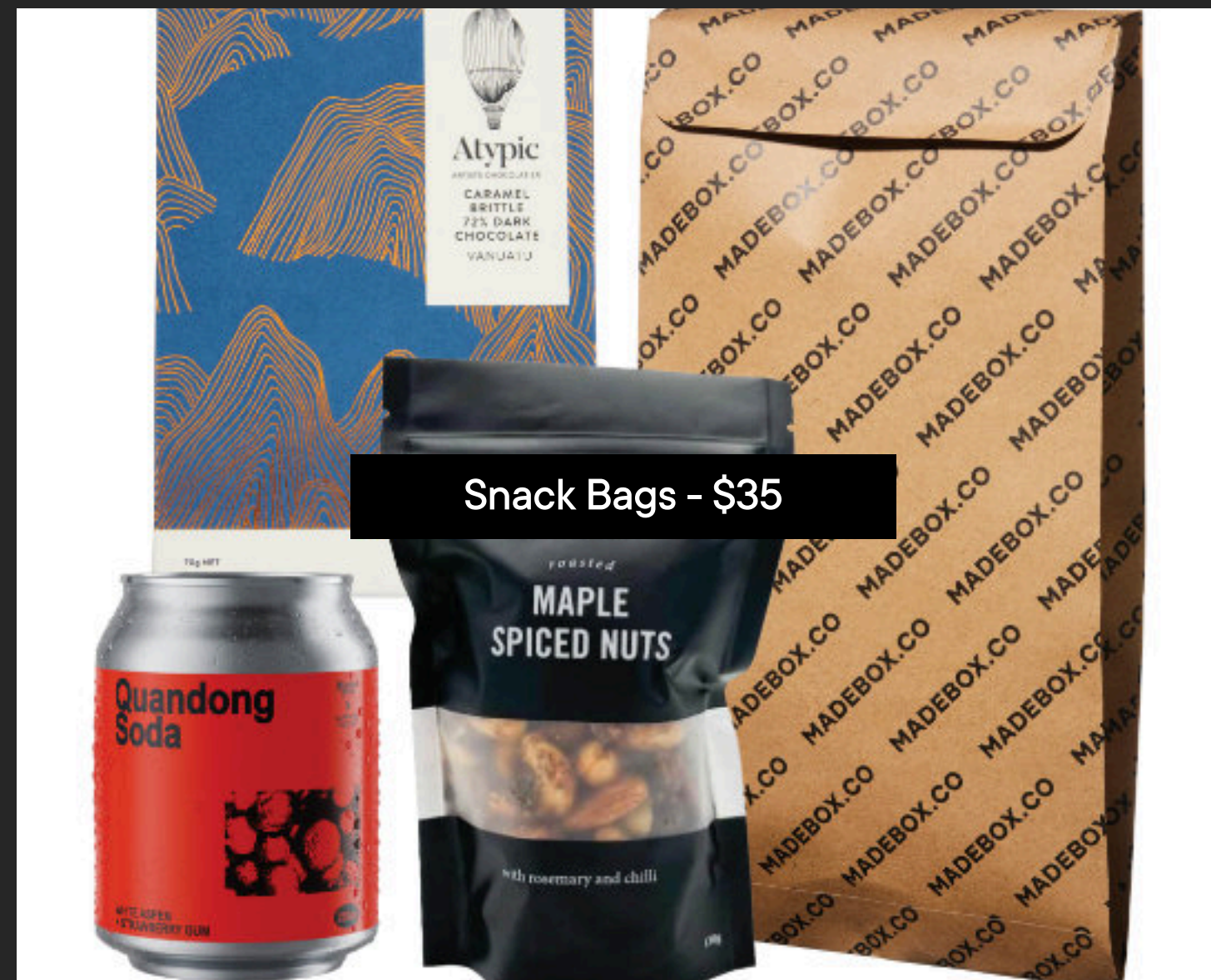
Snack Bags - $35