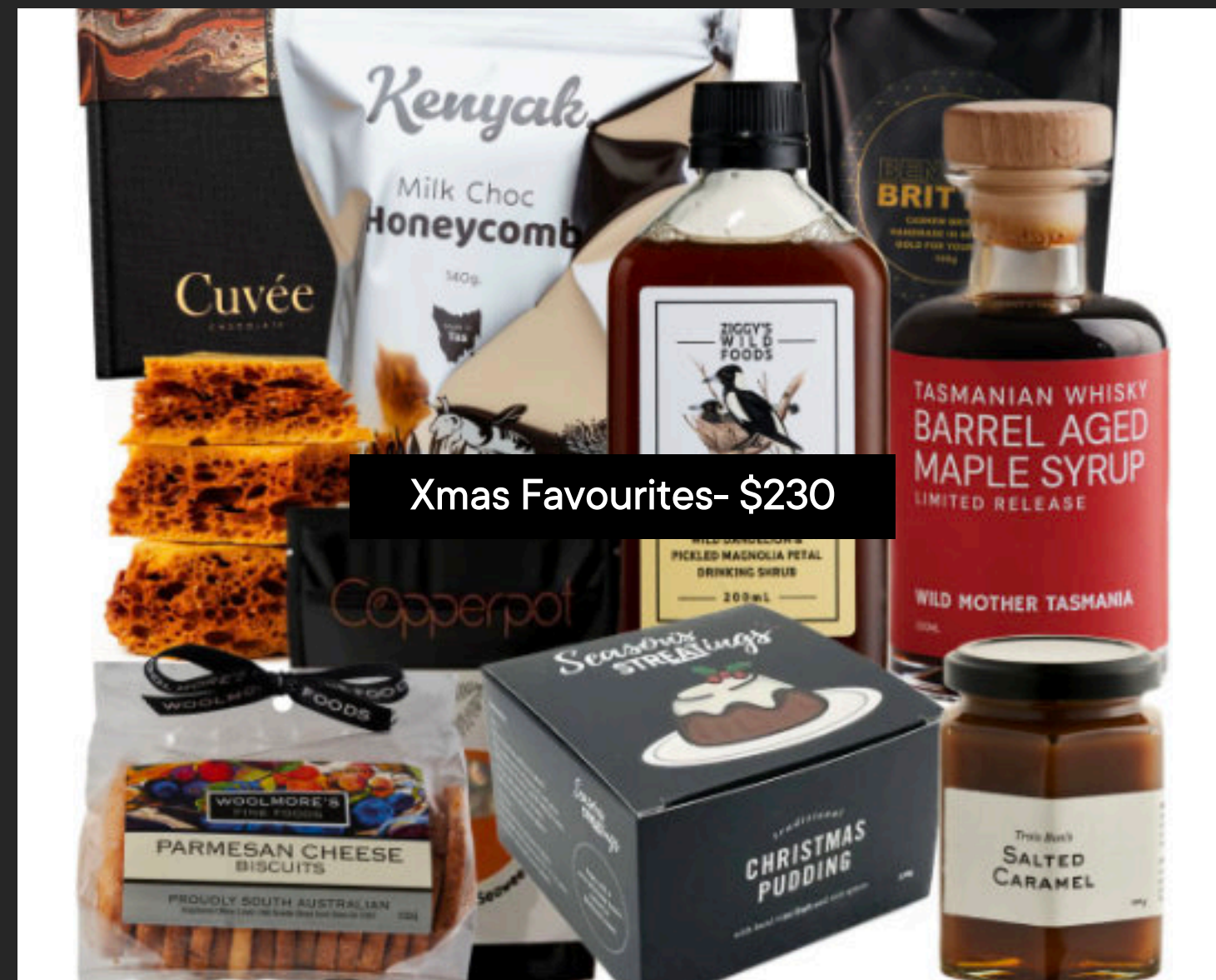
Xmas Favourites- $230