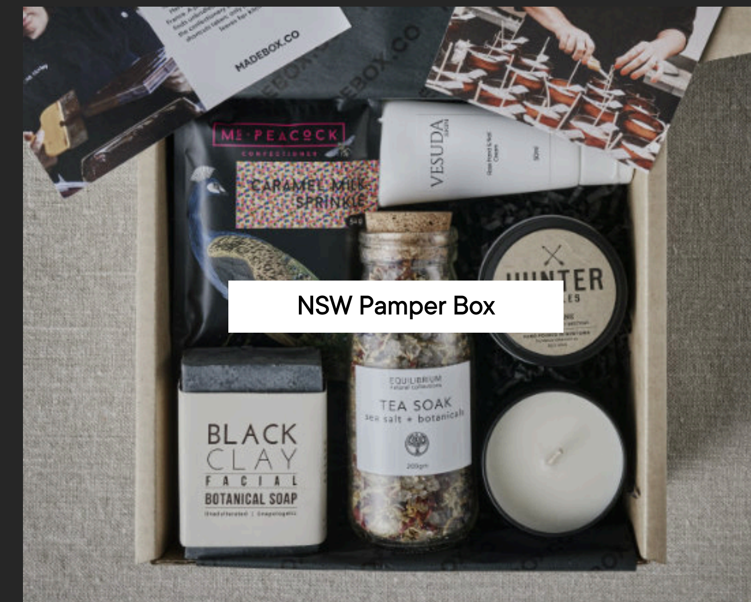
NSW Pamper Box