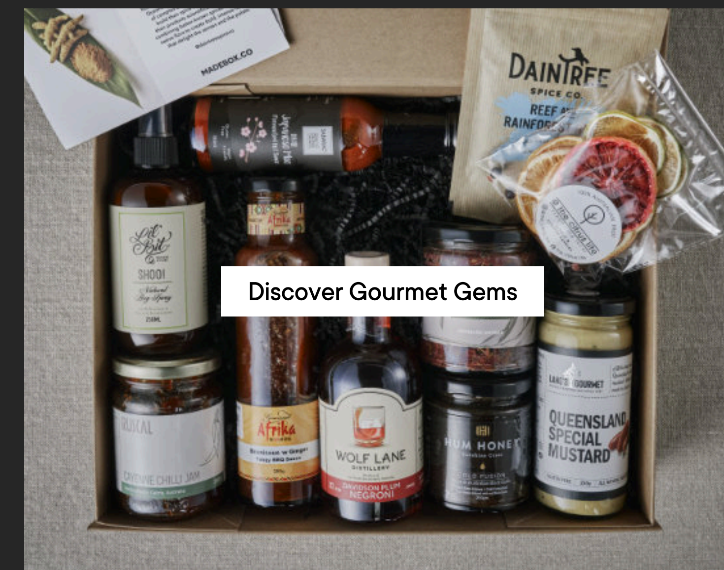
Discover Gourmet Gems

Prices & products subject to change and availability. contact us for accurate pricing & curation.