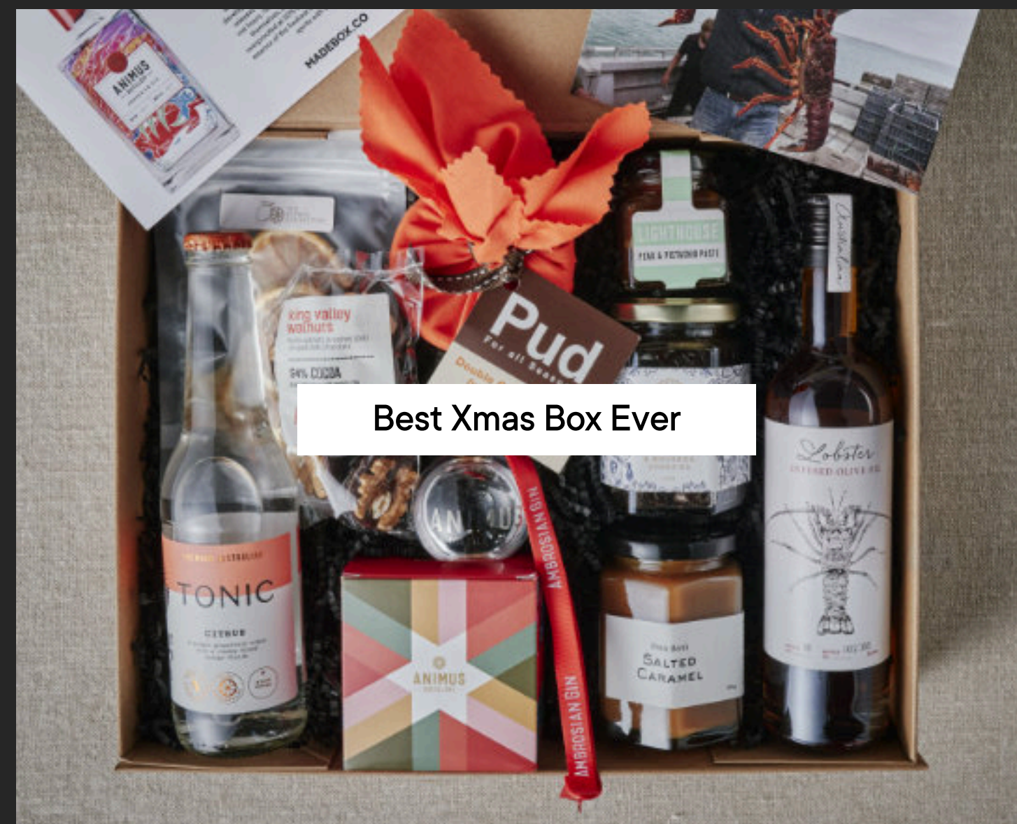
Best Xmas Box Ever